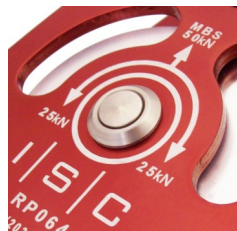
Bushings Ideal for high loads at low speed