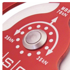
Roller Bearings Ideal for low loads at high speed

ISC Prussik Pulleys have tamper-proof Rivets, in compliance with CE EN12278 (2007) & NFPA (1983). These pulleys are available with Bushings, or Roller Bearings. Fixed-wheel Shear Reduction versions are available on request*.