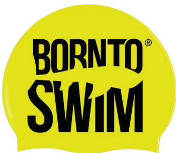
Born To Swim Classic Hat £8.95

Let everyone know you're an open water athlete with this silicone hat from Selkie. selkieswim.com