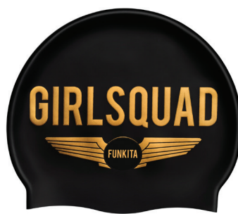
Funkita Girl Squad £8

Be camouflaged and stand out from the crowd at the same time with this brightly coloured hat from Selkie. Available in various colours. selkieswim.com