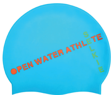
Selkie Sky Blue Open Water Athlete £8

Available in yellow, red or pink to help you stand out in the water. Bargain price. lomo.co.uk