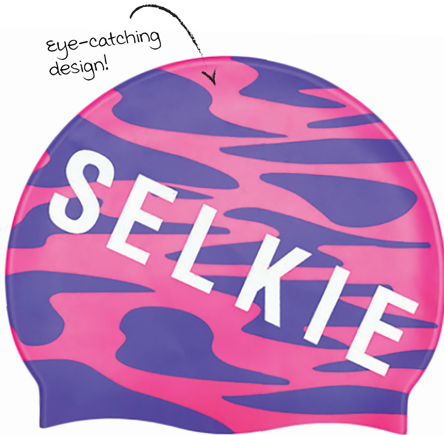
Selkie Pink Camo Print £8

Because you are born to swim and everyone needs to know it. Available in a whole array of colours. bornertoswim.eu