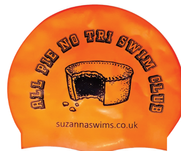
All Pie No Tri Swim Club Club hat Club membership £8

Join the girl squad with this black and gold hat from Funkita. funkita.com