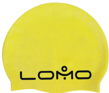
Lomo Silicone Swim Hat £1.99

Keep your head warm and be visible in the water with a silicone hat