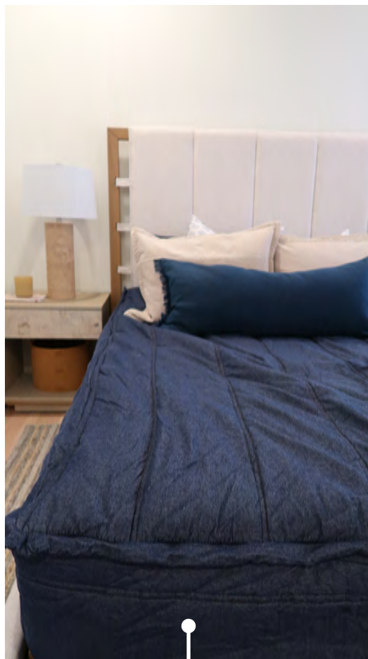
Not put on bed well