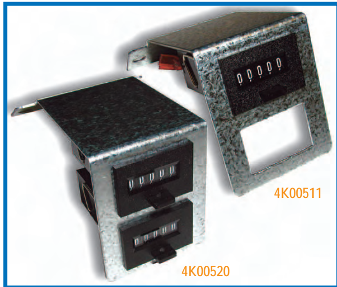
RESETTABLE COUNTER PACKAGES