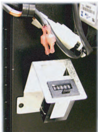
A Resettable BILLS IN Counter mounted to the door of an MC200, next to the Bill Acceptor.