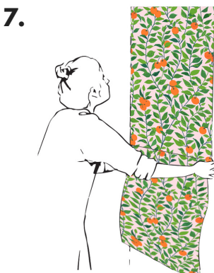
7. Install your next panel below or to the side of your previous panel so they match up, and repeat steps 2-6.