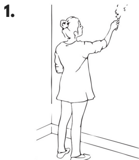
1. Clean walls & dry walls.

Option B - Edge to Edge: Professional installer recommended. Measure 1/4" from the right edge of the panel. Using a sharp edge, remove the 1/4" strip running the length of the panel. Measure 1" from the bottom edge of the panel. Using a sharp edge, remove 1" stripe running the width of the panel.