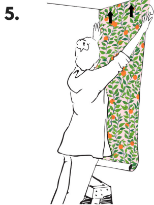
5. Line up the top panel edge with the ceiling, or top of wall. Beginning from the top corner, press the 2"-4" strip firmly onto the wall.