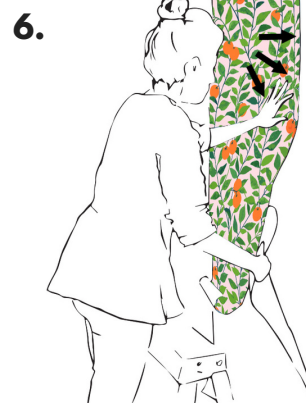
6. Once the panel is secure, reach under & grab the liner. Slowly pull the liner away from the panel while pressing the paper onto the wall & smoothing as you go.