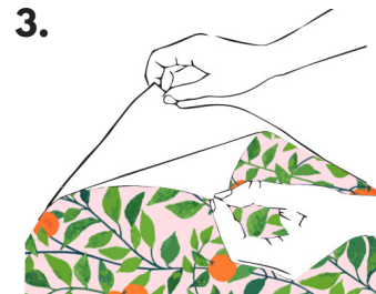
3. Starting at the top corner, gently pull the panel away from the liner.