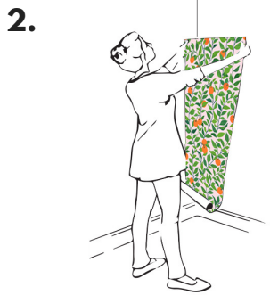
2. Map out where each panel will be going on your wall.