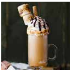
Blended S'mores Iced Coffee