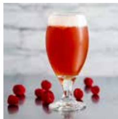
Raspberry Berliner Weisse