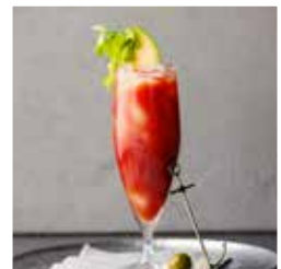
Mango Habanero Bloody Mary