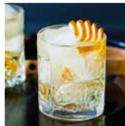
Pear Almond Gin & Tonic