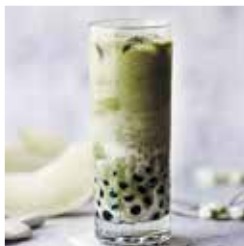
Honeydew Melon Boba Tea