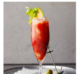
Mango Habanero Bloody Mary