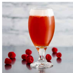
Raspberry Berliner Weisse