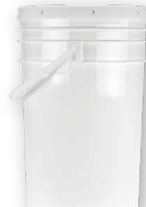
BUCKET 6 GAL (60 lb)