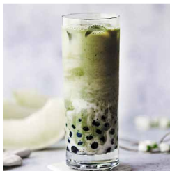
Honeydew Melon Boba Tea