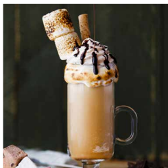
Blended S'mores Iced Coffee