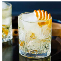
Pear Almond Gin & Tonic