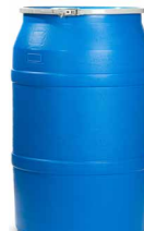
DRUM 55 GAL