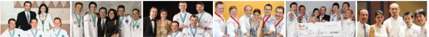
2002 Gold Medal: Team USA