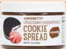
CHOCOLATE PEPPERMINT Creamy