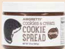
COOKIES & CREAM Creamy & Crunchy