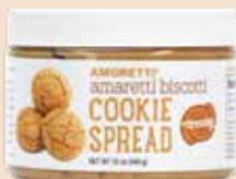
AMARETTI BISCOTTI Creamy & Crunchy