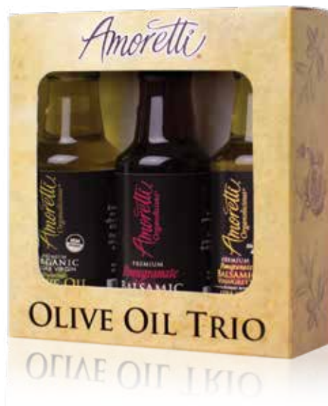
#43120043 Olive Trio Variety Pack