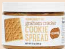
GRAHAM CRACKER Creamy & Crunchy