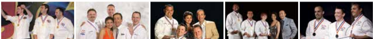
2003 Gold Medal: Team Caillot