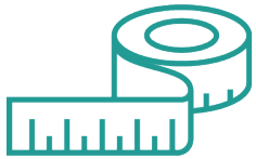
soft measuring tape