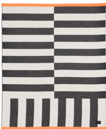
Black, White, Orange (border)

100% Merino Wool (Superfine) Produced in Lithuania