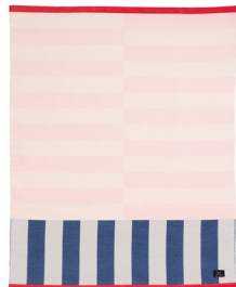
White, Pink, Grey, Blue Red (border)