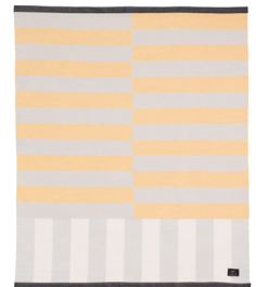
Light grey, Nude, Cream, Black (border)