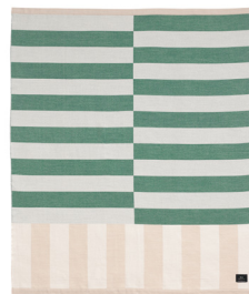
Dark green, Nude, White, Nude (border)