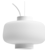
Large Matte Ivory