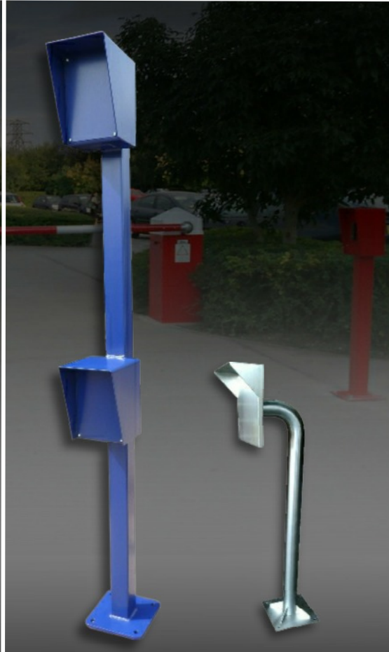
Standard & Dual Height available Also available in stainless steel