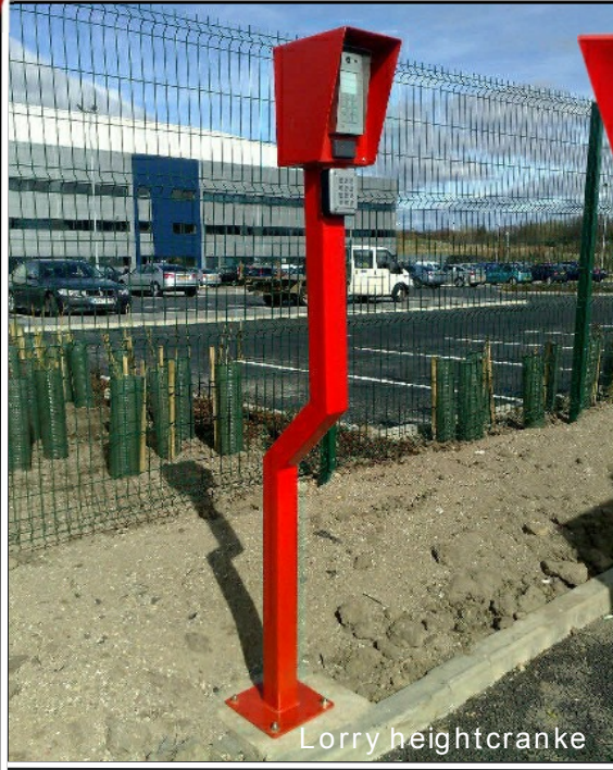
Lorry height crane