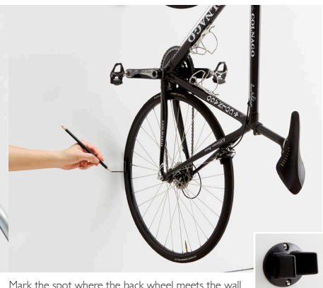
Mark the spot where the back wheel meets the wall