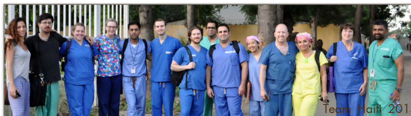
Team Haiti 2014