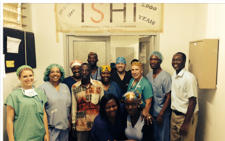
2014 Ghana Team with our 1000th Patient