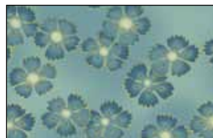
NIWA 4388 T*