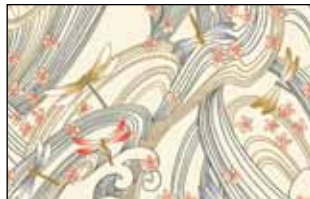
NIWA 4387 MU