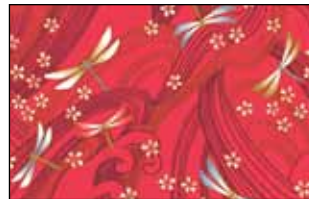
NIWA 4387 R*