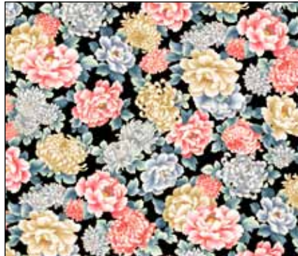
NIWA 4385 K†