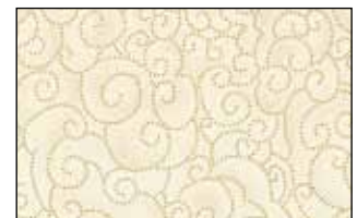
NIWA 4389 E