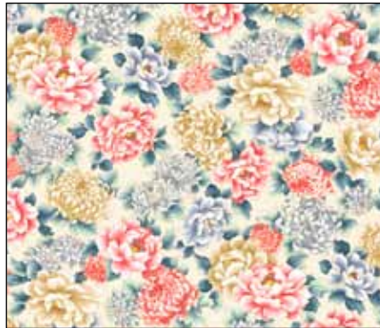
NIWA 4385 MU