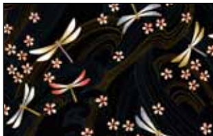
NIWA 4387 K