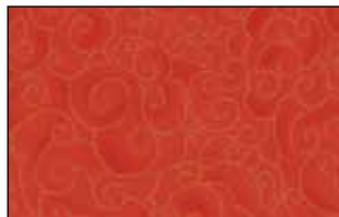
NIWA 4389 R