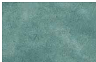
SUEM 300 BG*