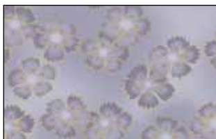
NIWA 4388 LB