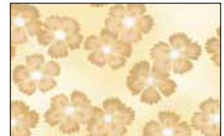
NIWA 4388 AU