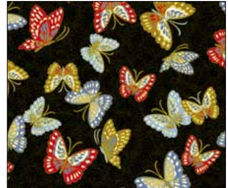
NIWA 4386 K