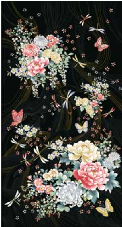
NIWA 4384 PA*