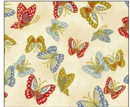
NIWA 4386 MU