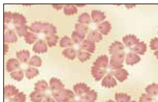
NIWA 4388 LP*