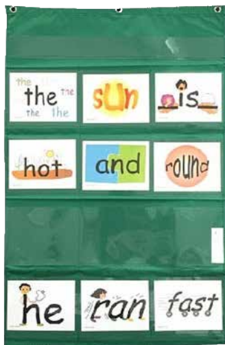
2. Pocket Chart