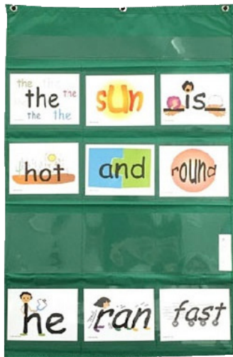
2. Pocket Chart