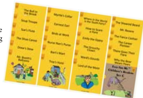
5. Practice Reading