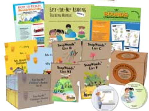
7. Teach Reading - Easy-for-Me Reading, Kit 2 (grade 2)