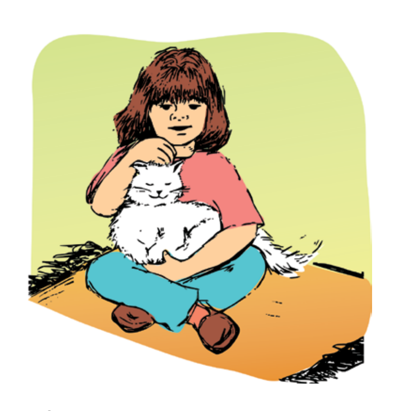
A fat cat sat on Pat on a mat!