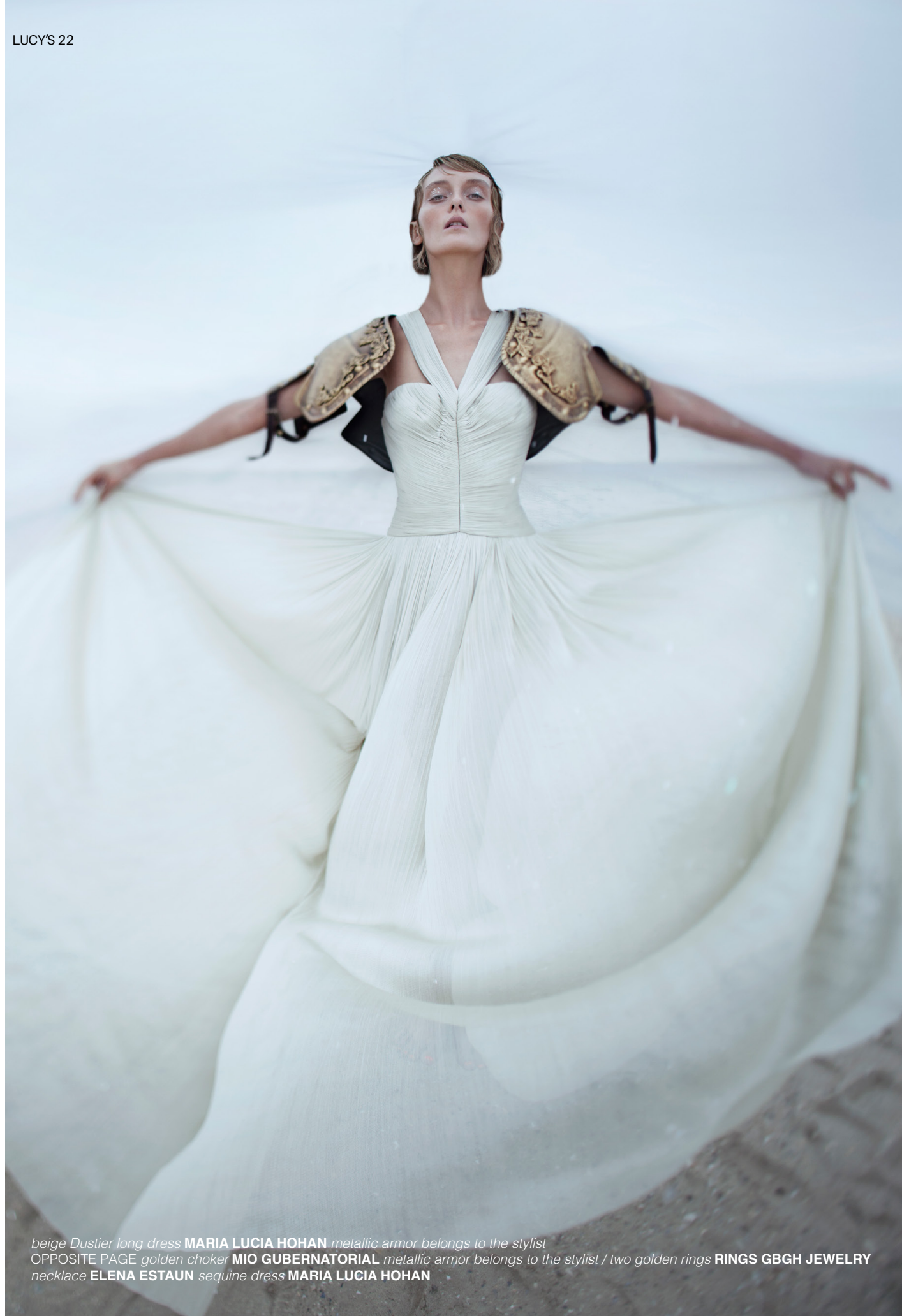
beige Dustier long dress MARIA LUCIA HOHAN metallic armor belongs to the stylist OPPOSITE PAGE golden choker MIO GUBERNATORIAL metallic armor belongs to the stylist / two golden rings RINGS GBGH JEWELRY necklace ELENA ESTAUN sequine dress MARIA LUCIA HOHAN