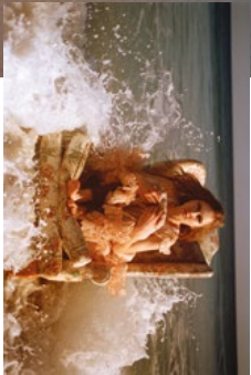
Elbise / Dress: KELSEY RANDALL Üst / Tank Top: FREE PEOPLE Pantolon / Pants: LEKA