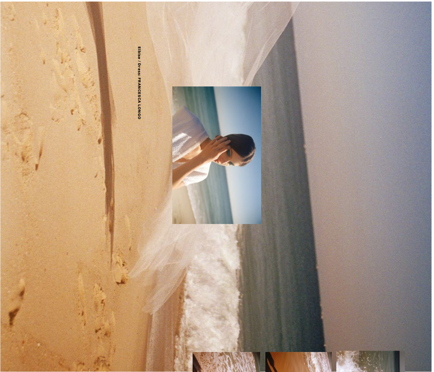
Elbise / Dress: FRANCESCA LONGO