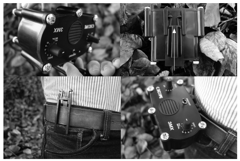
Above: Slide the belt mounting clip into the fixing slots on the underside of the control box and push all the way until the retaining lugs click into position.

Squeeze the control box retaining clips together using your thumbs as shown in the photograph. The control box will now slide towards you free of the control box mounting clip. The control box can be fitted to your belt using the clip provided. In belt mounted use, be sure to wind the search-head cable up the stem at least to the length adjuster and secure it with tape or cable tie. This is because the lead will be detected like a target if it is left free to move.