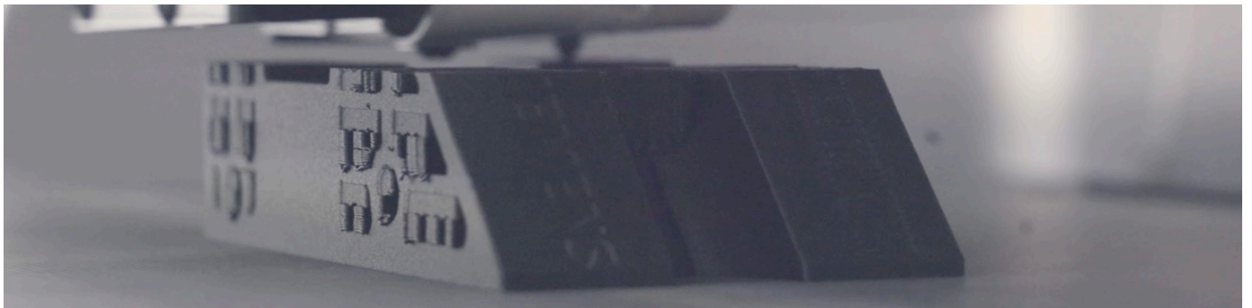
Siemens Gas & Power utilized its industrial X7 printer for strong, stiff fixtures.