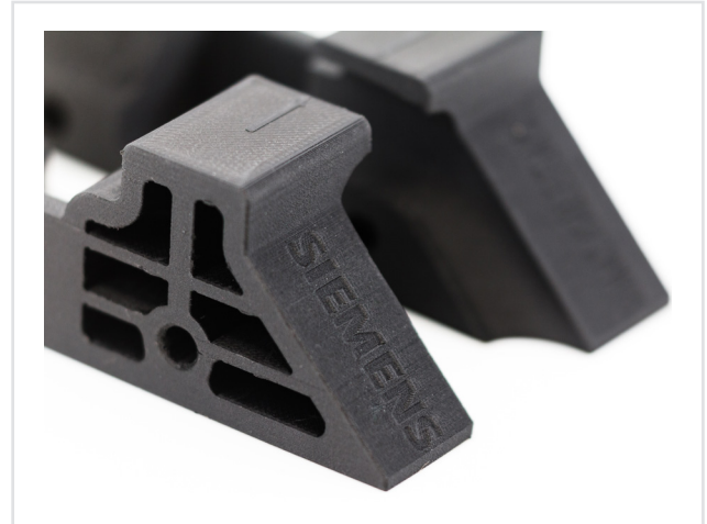
The holding devices are clamped on while the fuel nozzle is machined on a 5-axis mill.

The fixture allowed the Siemens technicians to clamp the geometrically complex fuel nozzle for machining on their 5-axis mill. As the metal part’s walls were quite thin, they were concerned that the fuel nozzle might flex under machining loads. However, since the Markforged-printed fixture was printed in Onyx — a nylon-based thermoplastic filled with chopped carbon fiber — the fuel nozzle could be clamped without it vibrating within the conformal fixture. The composite workholding has transformed the fuel injector nozzle from a machining challenge to an asset. The team is impressed with the quality and stiffness of the fixtures. “It’s absolutely a lean tool,” says Graichen of the X7. Fagertoft agrees, “The material itself is thoroughly impressive in terms of strength.”