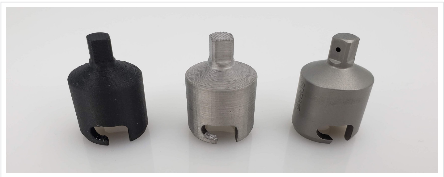
Helicopter sockets — which allow total screw construct removal — were first prototyped to allow orthopedic surgeons to test form and fit of the entire surgical tool.

ADAM GOSIK-WOLFE, MECHANICAL ENGINEER, SHUKLA MEDICAL