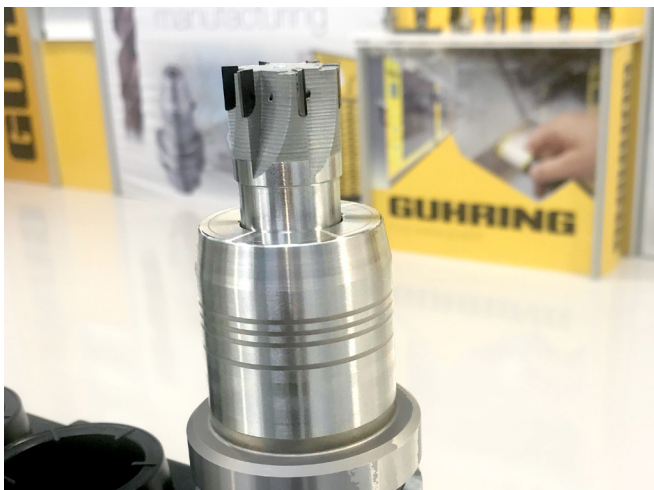
Guhring UK has sent metal 3D printed tools to customers to test new concepts.

The first 3D printed tool Guhring UK made was a basic milling cutter using H13 Tool Steel. “Within one day, we had designed and printed a tool in Onyx [nylon mixed with chopped carbon fiber], and we could immediately see if we were going to come up against any problems in manufacturing it. Within five days, we had printed and sintered a fully functional metal cutter body. Using Markforged 3D printers just speed up everything.” After adding the cutting tips, Guhring qualified the mill by testing it initially as an aluminum reamer, and found that it performed extremely well. The engineers then changed the configuration of the tool-tip geometry and ran the 3D printed tool as a milling cutter to test its capabilities, with an off-centre loading. This too worked exactly as planned. The 3D printed tool is 60% lighter than its traditional predecessor, which allows for faster tool changes in cycles and a reduction in cycle times. This application discovery has allowed the company to produce more versatile, lightweight tools for its customers at a far lower price.