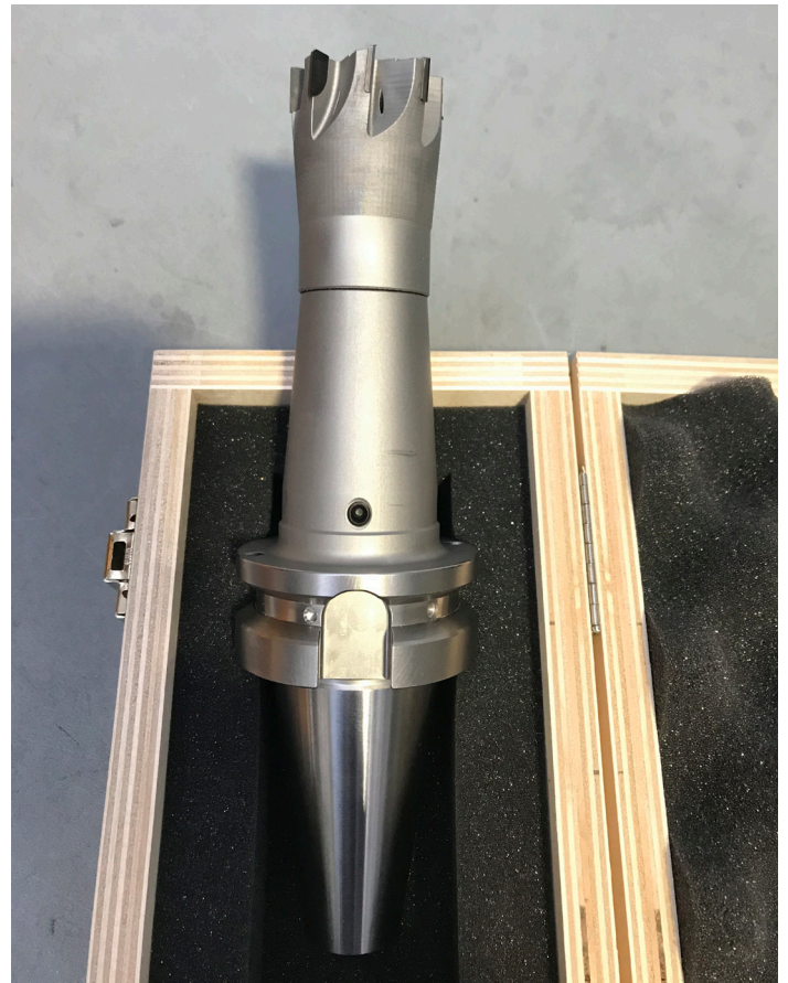
Tool tips were fixed to the 3D printed body before being ground to the required shape.

“ From verifying the tool’s design to printing the tool, we can vastly reduce the lead time with 3D printing, as opposed to manually machining the parts. ”