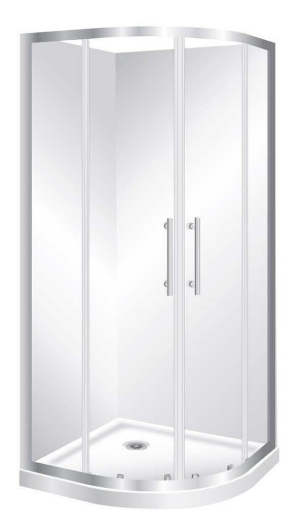
Pictured above - Orbit 900 x 900mm Chrome Flat Wall SKU 98010