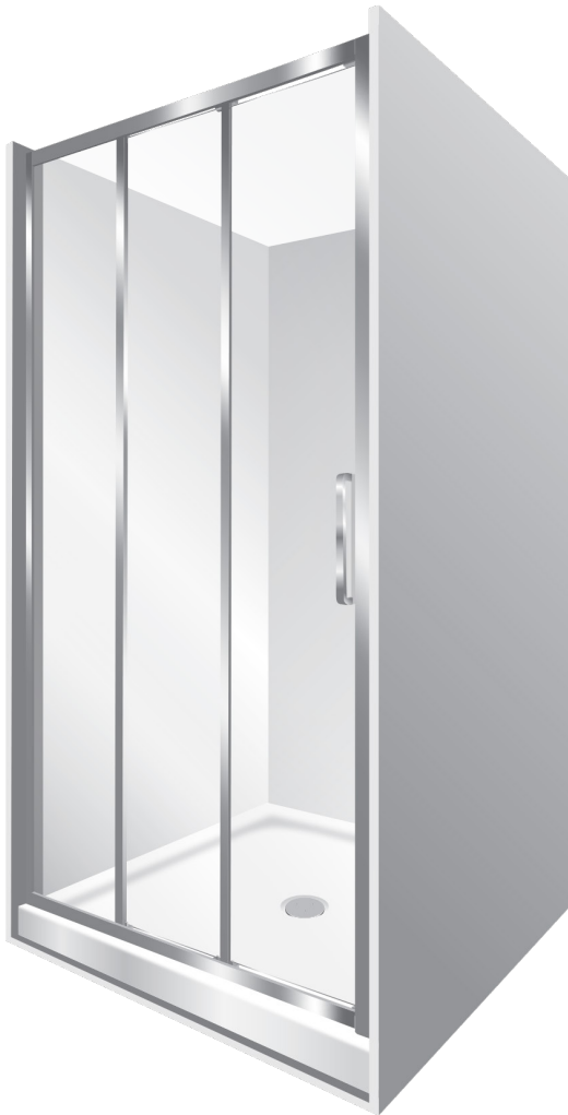
Pictured above - Elegance 900 x 900 x 900 3 Sided Alcove Flat Wall Silver