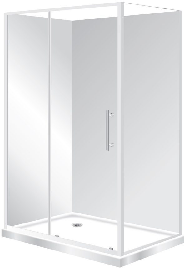
Pictured - Elegance 1200 x 800mm 2 Panel Sliding Door LH White Flat Wall SKU 98164