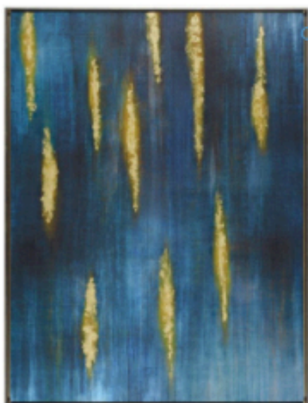
"Sapphire Glow" painting, $650, at Z Gallerie, @zgallerie