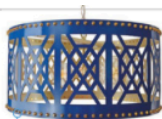
Don't Fret pendant light, $2,995, at Taylor Burke Home, @taylorburkehome