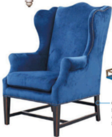
Office wing chair, $810, by Four Hands at Outrageous Interiors, @fourhands