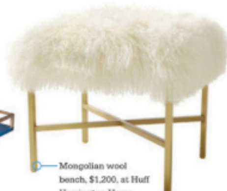
Mongolian wool bench, $1,200, at Huff Harrington Home, @huffharrhome