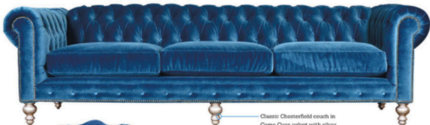
Classic Chesterfield couch in Como Cyan velvet with silver legs, $2,689, at COCCOO Home