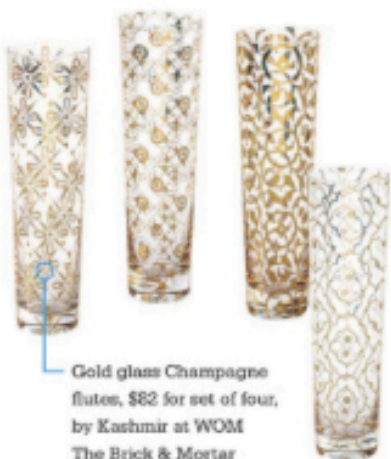
Gold glass Champagne flutes, $82 for set of four, by Kashmir at WOM The Brick & Mortar