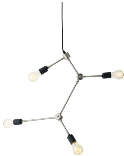
Brushed Steel 1920039