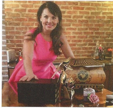
The Life Chest preserves photos, keepsakes and mementos.