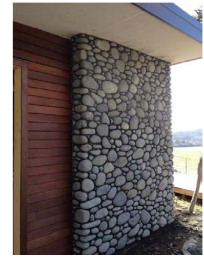
Stone Veneer Riverstone Type Linear Setout Stone Colour & Timber Match