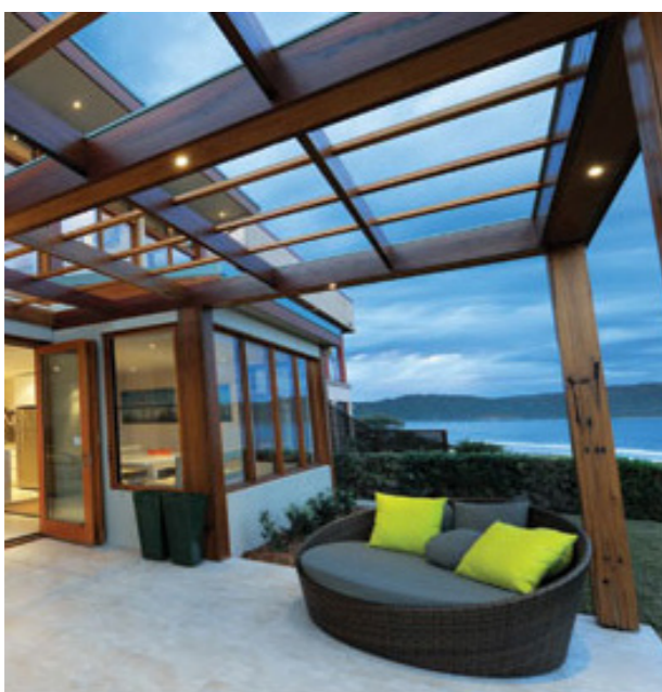
Pergola Structure Recycled Solid Timber Posts Exposed Fixings Timber Type & Colour