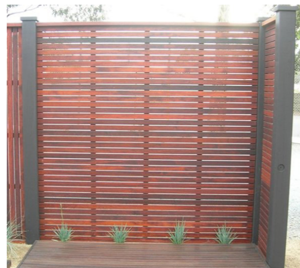
Timber Louvre / Screen Panel Louvre Configuration & Setout Vertical Bracing Elements Vs Horizontal