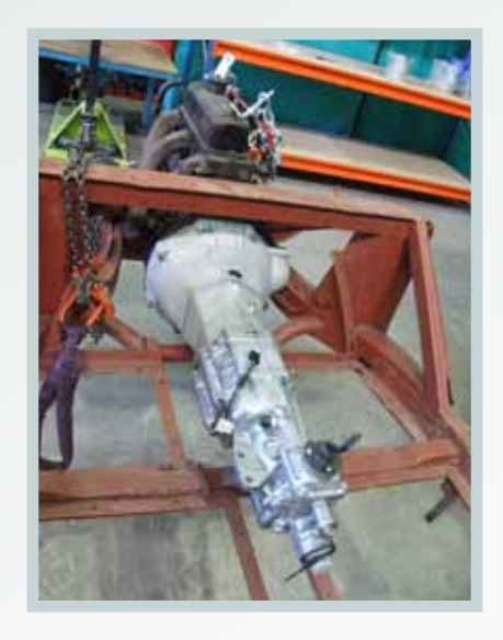
ABOVE: Other applications are planned. Here an MGB engine and 5-speed box is being fitted into an MGA chassis.

VAT-inclusive £2394. Fitting should take someone familiar with the MGB less than a couple of days before taking the car for a drive and enjoying the fruits of their labours, but Hinckley based Vitesse currently have a special offer of free fitting, and have offered to extend this for MGE readers to all cars whose booking is made by the end of May.