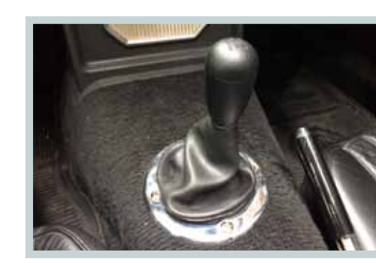
ABOVE: A new shorter gear lever emerges into the car exactly where the original MG one used to sit.

That potential for other cars is aided by a further change to the Mazda gearbox to include a modified rear housing to take a mechanical speedo drive gear. Whilst there was a facility on the original Mazda casting for a speedometer sensor pick up, because this was not a mechanical gear drive as found on the MGB it was not guite in the correct position. But the modified rear housing has the facility for the speedometer drive gear and cable connection to drive the original MGB speedometer, and a cable with the appropriate end to plug straight into the