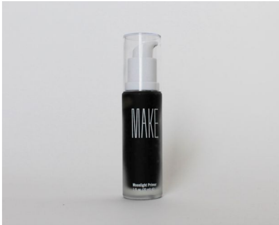
Moonlight Primer, $55

It's supposed to shield you and your skin from High Energy Visible Light — the blue-violet invisible light emitted from all of our devices — and Infrared Light. These two factors can (supposedly) lead to premature aging and skin damage and are both emitted from all of the tech devices we all use every day.