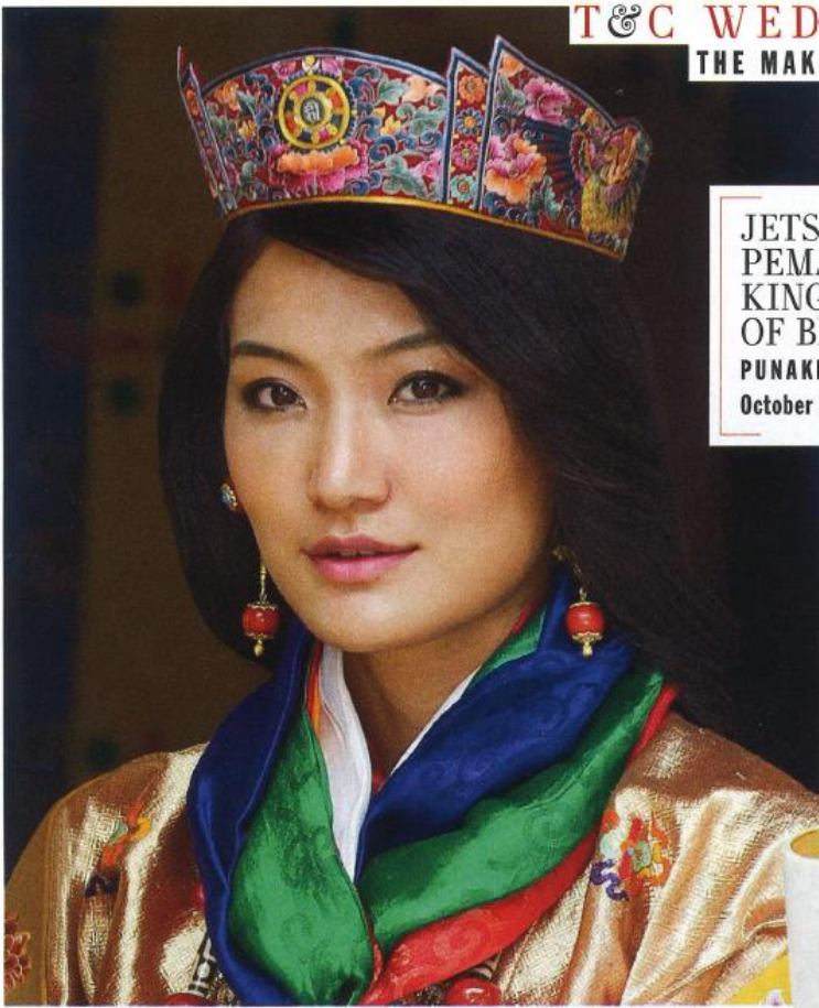
JETSUN PEMA & KING JIGME OF BHUTAN PUNAKHA, BHUTAN October 13, 2011

LANCOME MIRACLE CC CUSHION COLOR CORRECTING PRIMER ($40), SEPHORA.COM