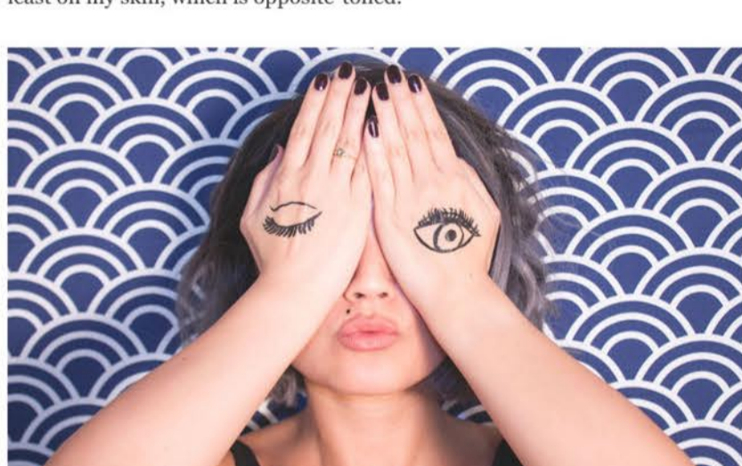
Putty: suddenly sex-kitten

Scarlet is a classic cool-toned red: it has a near 3D effect with its vibrancy, at least on my skin, which is opposite-toned.