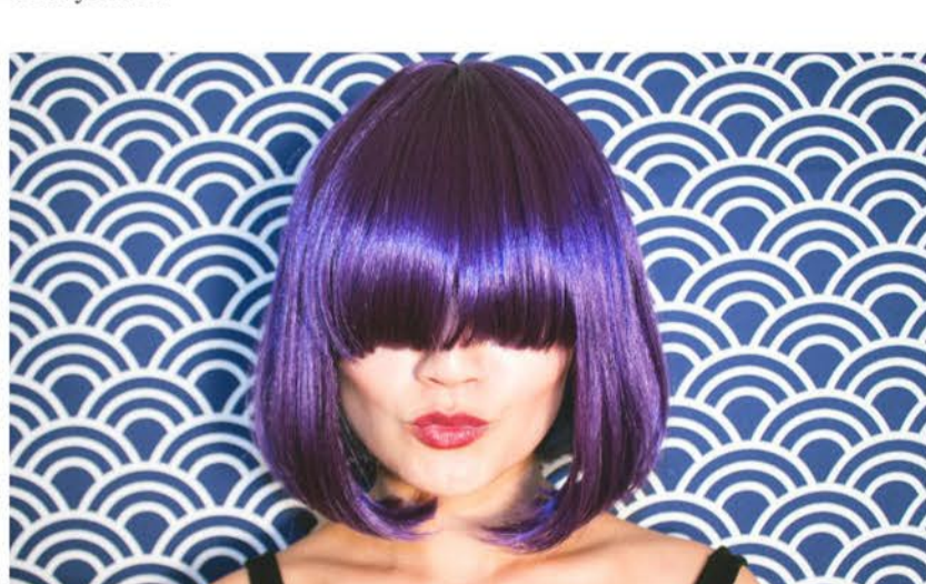
Jakarta: ultra violet just got literal

Putty is a great peachy-nude to make your lips appear naturally juicier without the obnoxious glare of lip gloss. I couldn't help but pair it with a beauty mark.