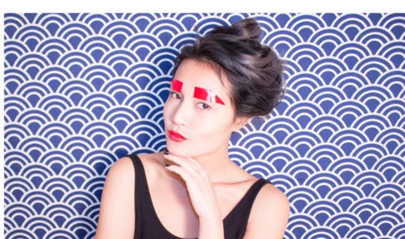
Scarlet: working towards anaglyph-chic here

The Tangerine is definitely on the citrusy side while Magma has a bit of a coral hue.