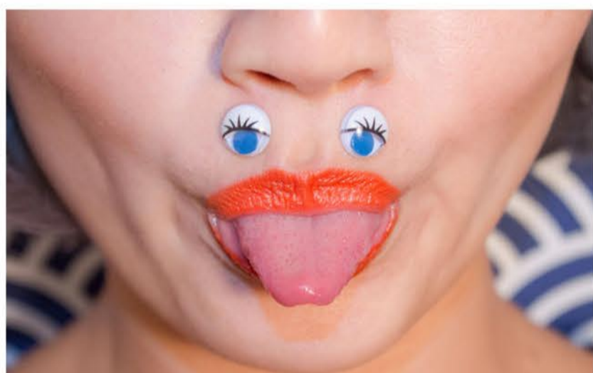
Good for sassin'

Fire is a warm, poppy red. It's an attention-grabber, for sure. My elderly aunt would call it a "statement" color while still remaining flattering in a "hitting the jackpot in Atlantic City" kind of way.