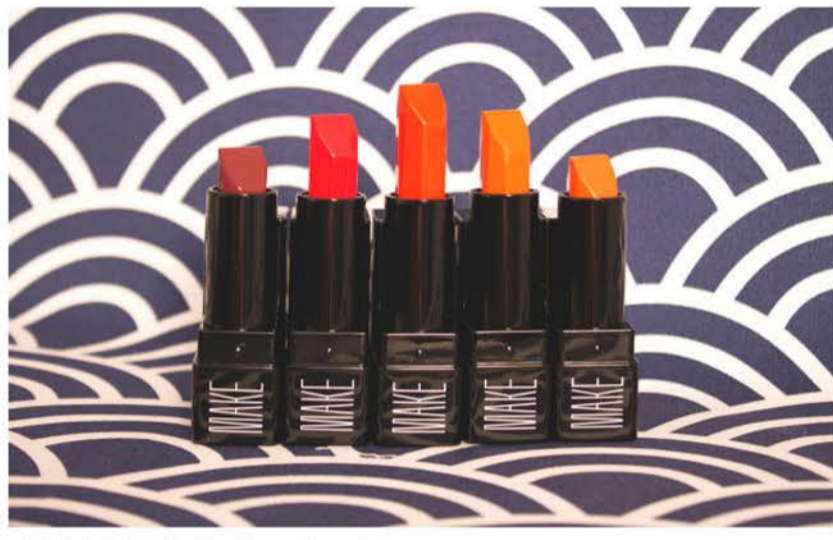
L-R: Jakarta, Scarlet, Fire, Magma, Tangerine

Also: these lipsticks are pretty gorgeous to look at, if I do say so myself. The packaging is simple, but architectural. Just look at those bullets!