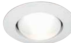
RT605WH Open White Ring Uses R40/PAR38 Lamps Order Code: 70959