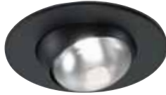
RT603BL Black Eyeball Uses R40, PAR38 Lamps Order Code: 79573