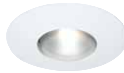
RT604WH Open White Trim Uses BR/PAR30 Lamps Order Code: 78762