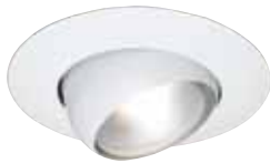
RT603WH White Eyeball Uses R40, PAR38 Lamps Order Code: 79551