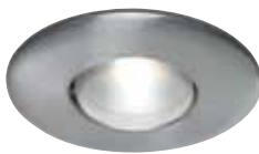
RT604SCH Open Satin Chrome Trim Uses BR/PAR30 Lamps Order Code: 78107