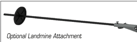
Optional Landmine Attachment