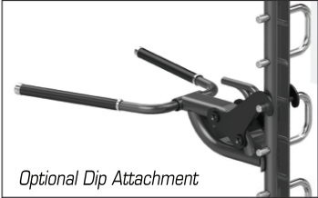
Optional Dip Attachment