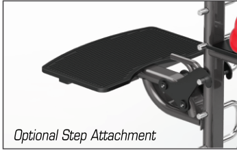
Optional Step Attachment