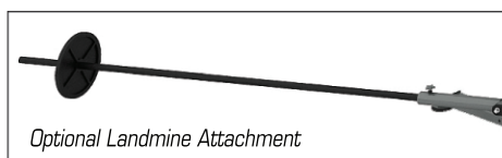
Optional Landmine Attachment