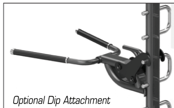
Optional Dip Attachment