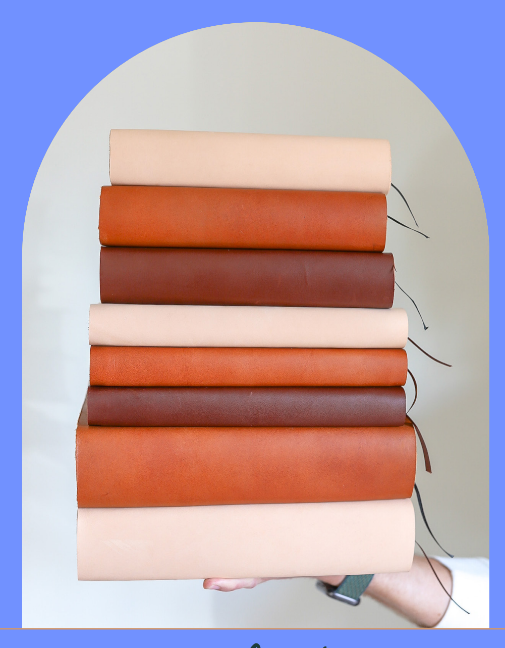
Your Custom LEATHER BIBLE