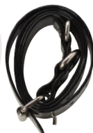
Additional TPU Collar