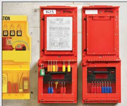
Areas with Frequent Lockout