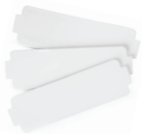
Rewritable Tags PKGP44055