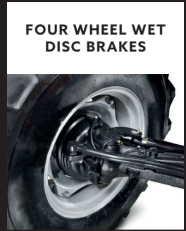
FOUR WHEEL WET DISC BRAKES