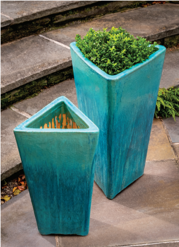
Shown in Antigua