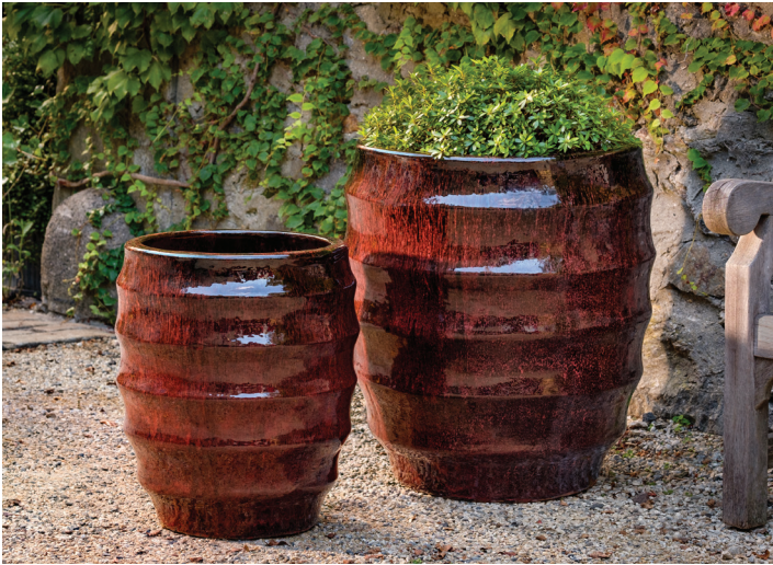
Shown in Bordeaux