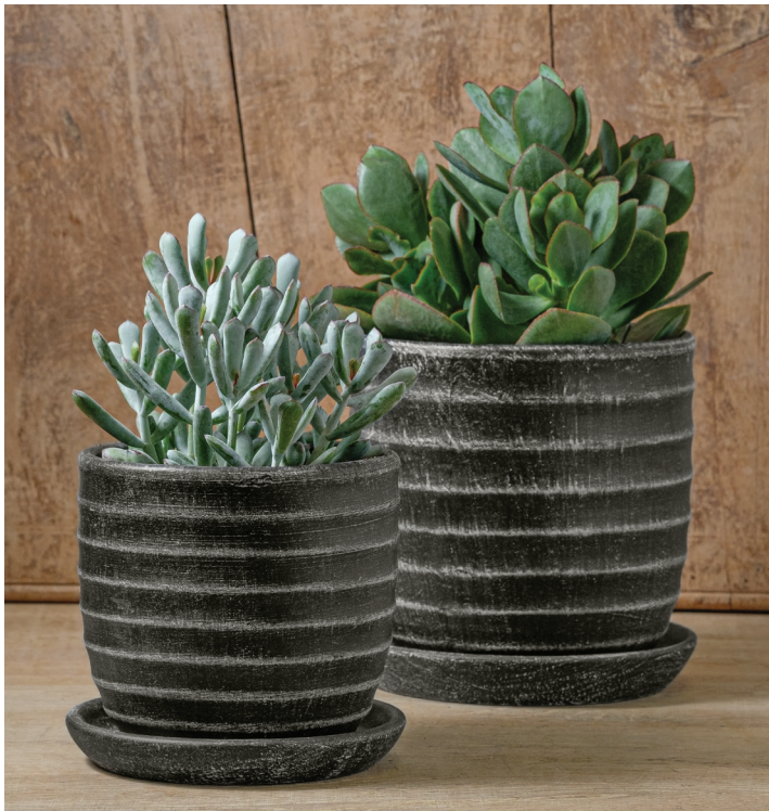
Shown in Dusty Black