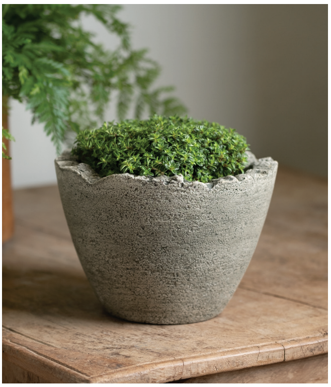
Shown in Alpine Stone