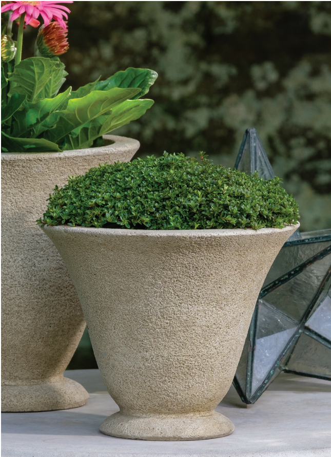
Shown in Verde