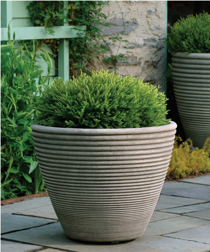
Shown in Greystone